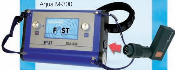
Bluetooth dongle for F.A.S.T. Aqua-M series