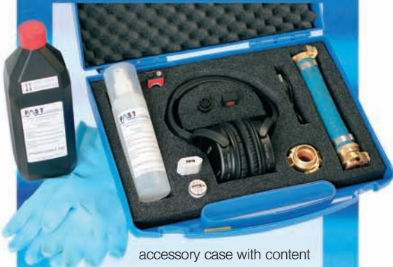
accessory case with content