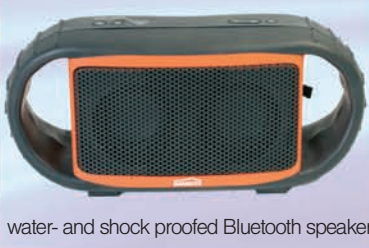
water- and shock proofed Bluetooth speaker